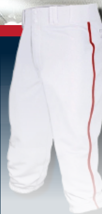
Baseball Express Men's Triple Play Piped Knicker Pant