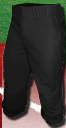
Baseball Express Youth Triple Play Solid Knicker Pant