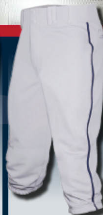
Baseball Express Youth Triple Play Piped Knicker Pant