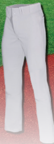
Baseball Express Youth Triple Play Solid Baseball Pant