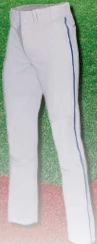
Baseball Express Youth Triple Play Piped Baseball Pant