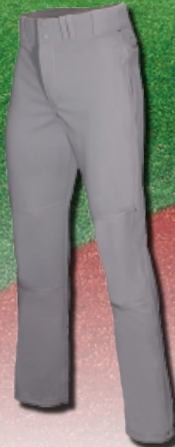
Baseball Express Men's Triple Play Solid Baseball Pant