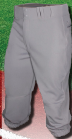
Baseball Express Men's Triple Play Solid Knicker Pant