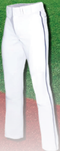
Baseball Express Mens Triple Play Piped Baseball Pant